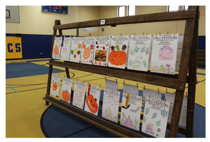
Unit 2 Posters