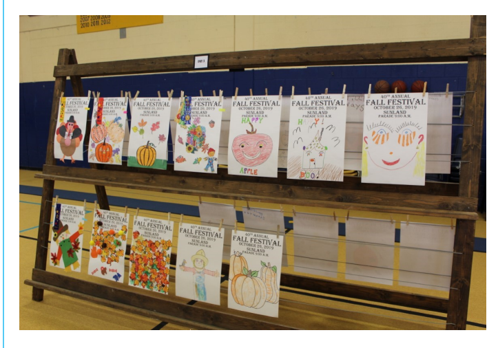
Unit 3 Posters